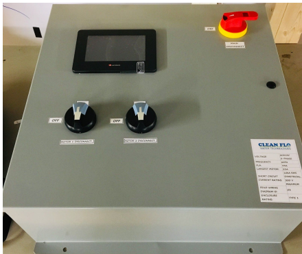
Figure 2 on left - Dual pump controller with HMI for large pumping skid (Front)